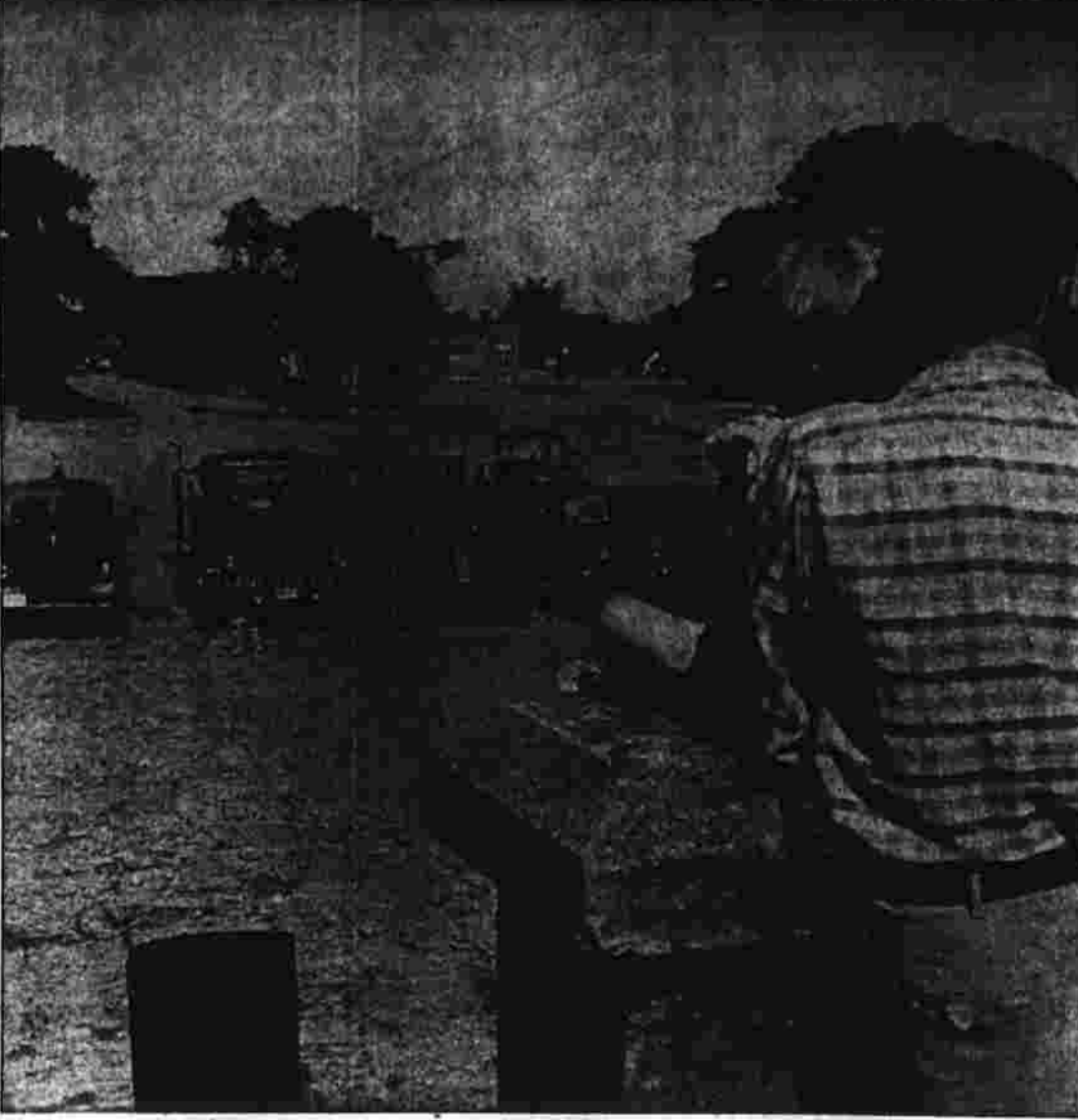
Construction work on Hartland Rd. is well advanced. The new section of main will be 12 in. in diameter...

Bids will be advertised at once for the relocation of the 10 in. double-bore Hartland Rd. sewer main.